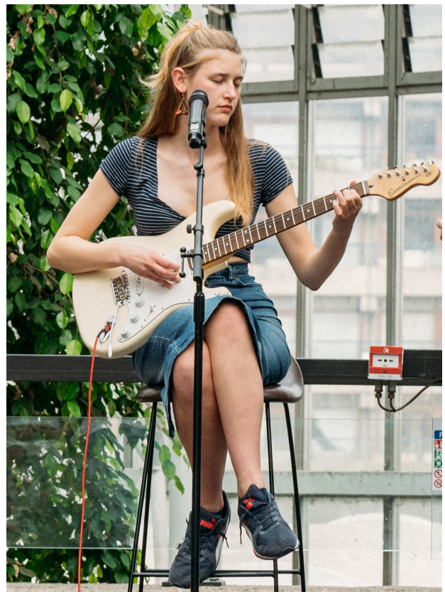
Performance in the barbican conservatory